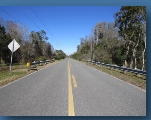
Financial Project ID: 435780-1

Tuesday, April 12, 2016 Open House: 4:00—6:30 PM Review project displays & talk with Dept. staff