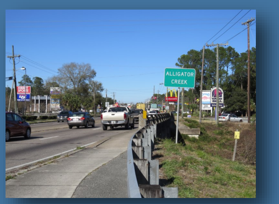
Financial Project ID: 434038-1

US 301/SR 200 Bridge Over Alligator Creek